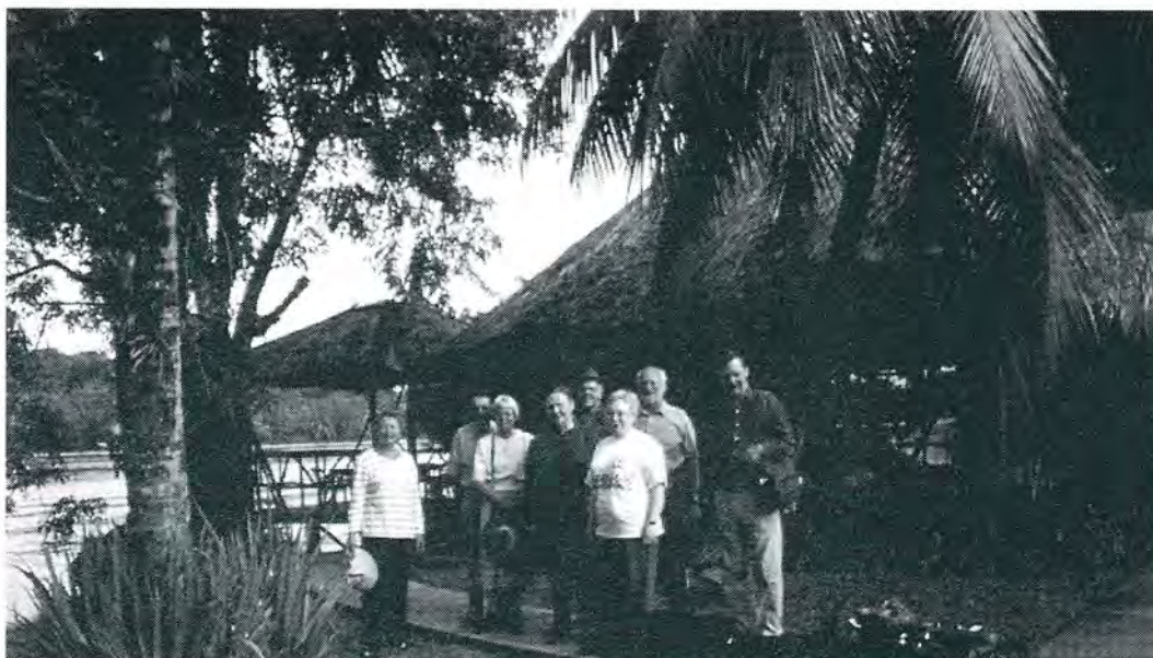
The Friends group who toured to Costa Rica had an exciting time in a humid 'tropical paradise' amid lush vegetation, birds and other animals. They're pictured in Tortuguero National Park on the Caribbean coast.

We have some spare copies of Botanic Magazine which members may obtain by phoning the Friends office on 9650 6398. They are Volume 6, published in 1995, and Volume 3 from 1988.