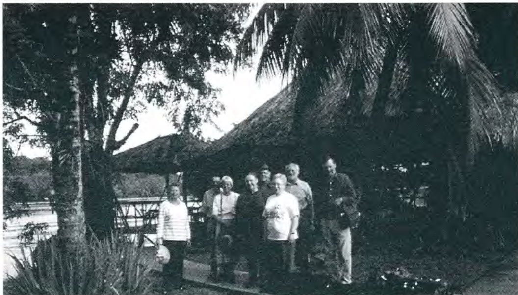
The Friends group who toured to Costa Rica had an exciting time in a humid 'tropical paradise' amid lush vegetation, birds and other animals. They're pictured in Tortuguero National Park on the Caribbean coast.

We have some spare copies of Botanic Magazine which members may obtain by phoning the Friends office on 9650 6398. They are Volume 6, published in 1995, and Volume 3 from 1988.